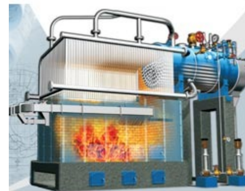
A stoker boiler.

Level 4 assumes that boiler and furnace systems are operated efficiently in accordance with best practice and best available technology to achieve the maximum possible saving of 28% in final energy demand by 2050 relative to that of 2006.