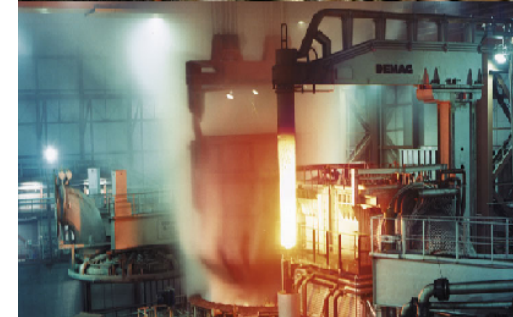
Underground mineworker and electric arc furnace