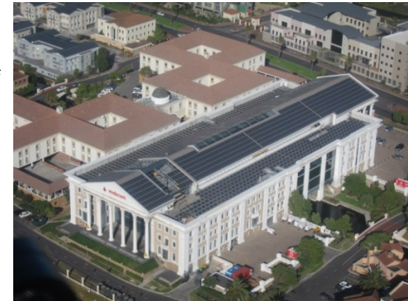
The 542 kW rooftop PV installation at the Vodacom office in Cape Town.

In this scenario, all residential homes have a solar PV system, this provides capacity of 52,000 MW by 2050. Adoption rate in the commercial sector is at 10%, leading to a total capacity of about 20,000 MW by 2050.